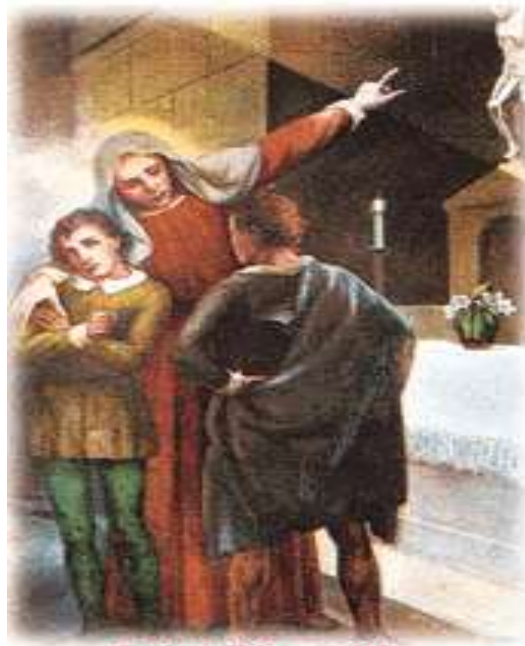
Saint Rita with Her Two Boys