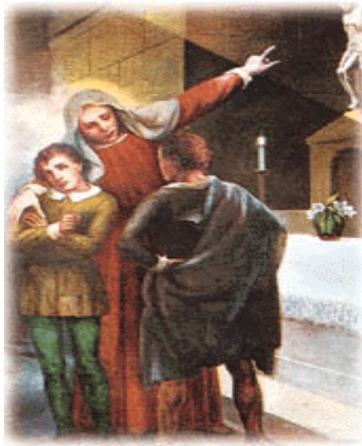
Saint Rita with Her Two Boys